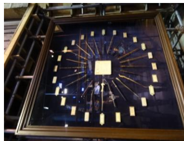
Les baguettes magiques